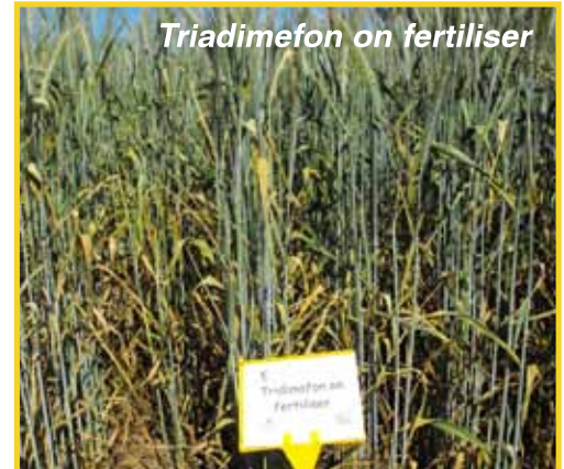
Triadimefon on fertiliser

If people prefer to treat their fertiliser with liquid Flutriafol (similar to Impact®) we have great prices on that too.