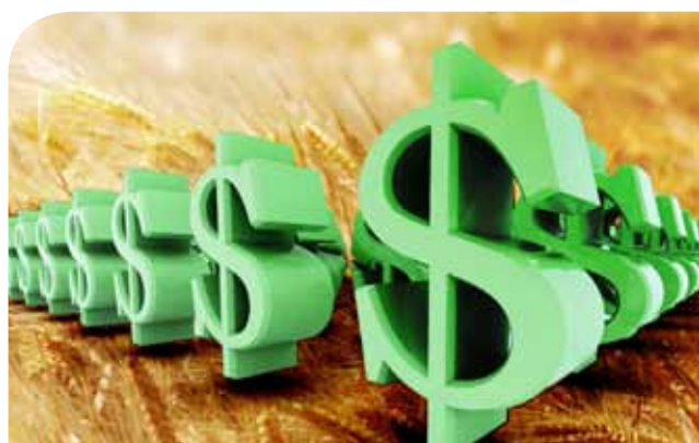
Dumping duties will cause prices to rise

Nufarm are at least 20% owned by Sumitomo and Accensi we understand is fully owned by overseas interests.