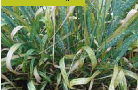
CONTROL no fungicide