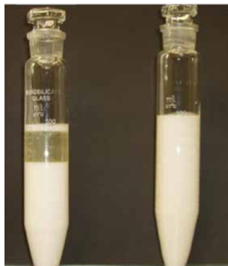
Example 2: Flexi N can wreak havoc on emulsifiers and dispersants. Sample on left example of adding Flexi N to the tank before an EC that has led to serious separation problems.