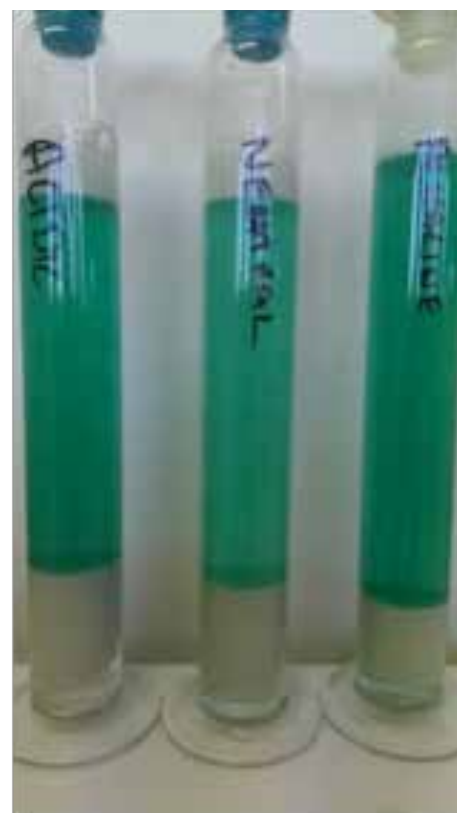
Example 1: Glyphosate added to solution first then Ester 680 causing the Ester to precipitate. The pH of the water made no difference.

All remaining adjuvants are added last. This should be done after all the other products have had a chance to mix thoroughly through the tank.